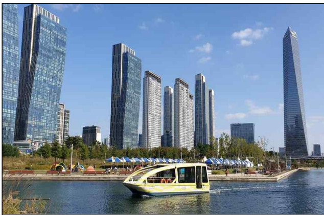
(3) Aqua-Leisure [Water taxis on river]