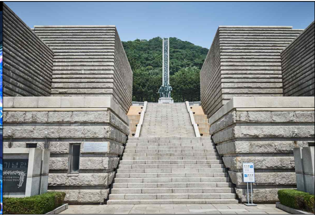
(2) Historical tour [Memorial Hall & City Museum]