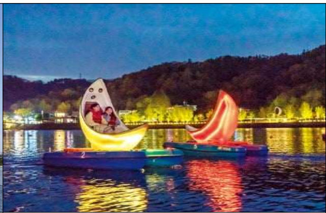
(4) Night tour on river [Moon Boat with night-view photo]